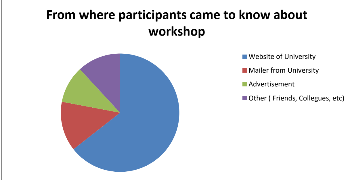
Fig.1. Source of information about organization of this workshop