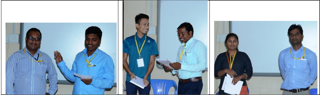
EXCHANGE OF INTRODUCTION PARTICIPANTS - INTRODUCED BY OTHER PARTICIPANTS